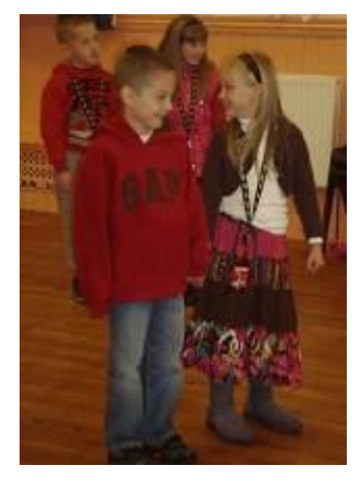
<u>Day 7</u>: Tue 19<sup>th</sup> October ~ Country Dancing – Local Park

Good fun today as the children started their Scottish Country Dancing lessons. The somewhat reluctant boys were eventually paired off and everyone had lots of fun mastering these strange new dance steps.